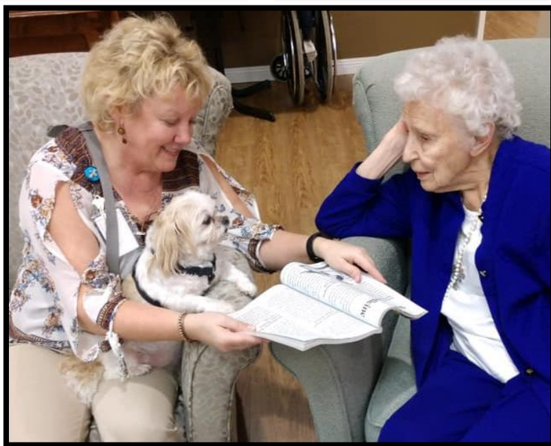
Our new favorite activity!